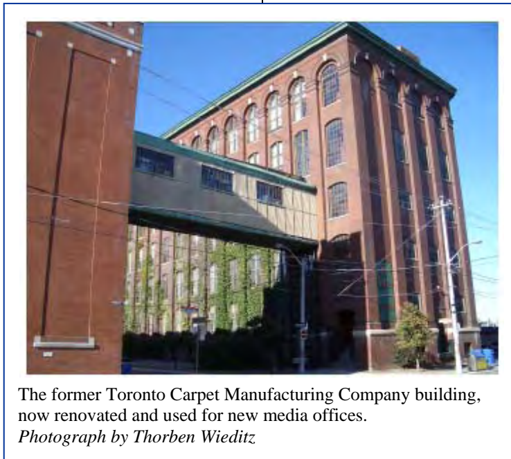
The former Toronto Carpet Manufacturing Company building, now renovated and used for new media offices.

Although the area went through a lengthy period of disinvestment, it was nonetheless the subject of real es-