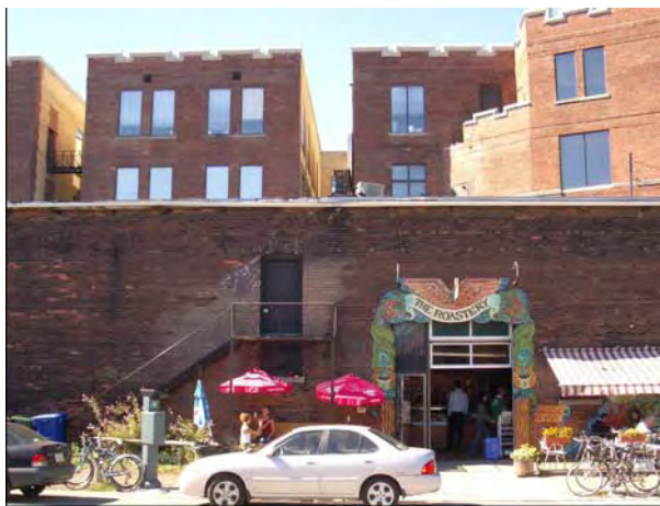
A popular lunch spot in Liberty Village.

In addition, the government's decision to demonopolize local telecommunications services in 1999 increased pressure to allow the conversion of the area, as local real estate entrepreneurs were now able to offer fast Internet connections through local service providers as an additional benefit to their tenants. This encouraged local property owners and developers to market Liberty Village to new media businesses. This feature attracted further IT and new-media companies to locate in Liberty Village, where giants such as Adobe (in the Carpet Factory) or Sony BMG had already taken space.