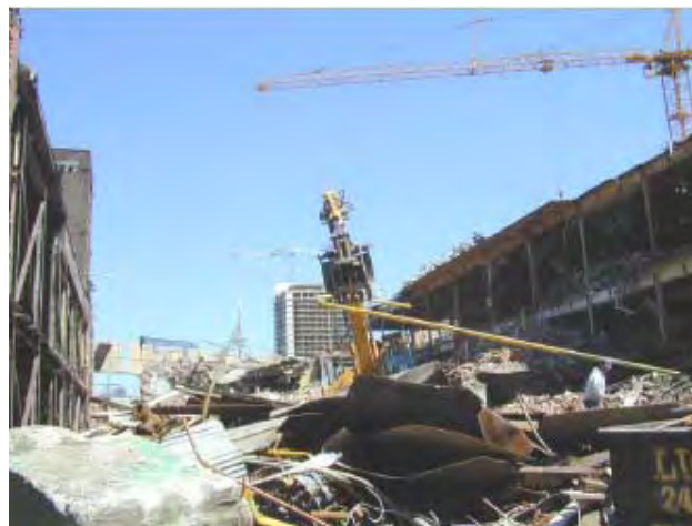
The Irwin Toy warehouse is being remade into a place to “live, work and play.” Looking west through the partly demolished building.

Other than this feature, the LVBIA works in the same way as other BIAs. The organization is financed through a special levy on municipal business taxes in Liberty Village. The levy is collected by the municipality, but administered by the BIA. The BIA is part of the municipal economic development initiative to improve the area, promote festivals and special events, and improve building facades through matching grant programs.