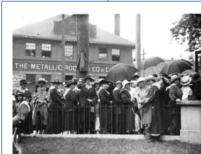
Some of the 4,000 women war workers lined up for their last pay in 1918. Employment in the area peaked during the World Wars.

After the Second World War, industries began to move to the suburbs and the area hollowed out. The To-