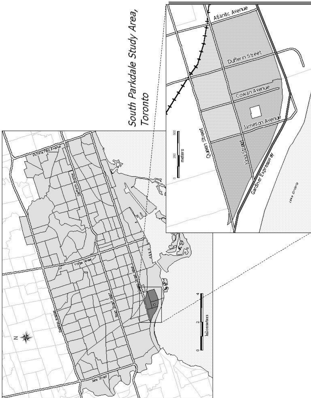
Figure 1: South Parkdale, Toronto